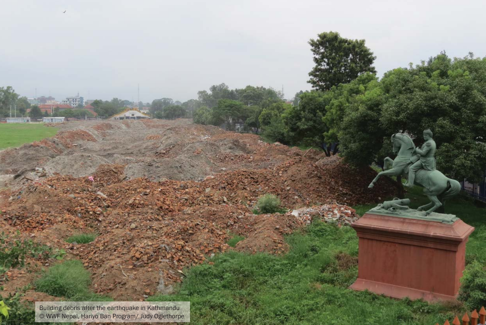
Building debris after the earthquake in Kathmandu

for new settlements, and maintain or restore ecosystems so that they can provide protection and other services in the future.