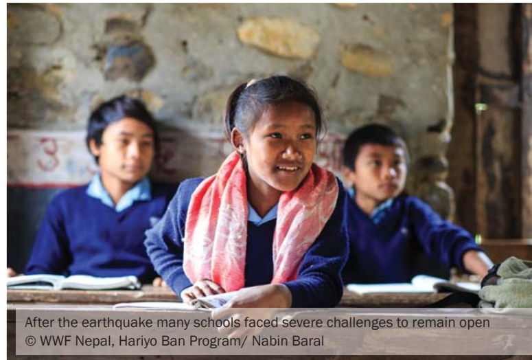
After the earthquake many schools faced severe challenges to remain open

Promote sound environmental practices through schools and other academic institutions. Reconstruction of school buildings can have environmental impacts. Follow good practices for rebuilding, and conserve school water sources. Mainstream disaster risk reduction and green recovery approaches in curricula of schools and colleges to improve natural resource management and raise disaster risk awareness for greater resilience. Involve students in green recovery activities in their schools, colleges, universities and communities.