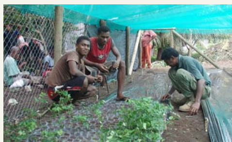
Malomalo community setting their native tree forest nursery