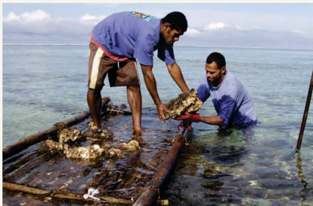
Villagers collecting live rock, Coral Coast, Fiji

Some of the focal alternative income activities have been to synergise the village potential to the local tourism industry, through handicraft production and local crop supply to resorts through community model farm development. Effort has also been made to build on community conservation efforts such as the introduction of native trees to the landscape and income potential through sandalwood introduction. Feasibility work to develop small scale eco-tourism for the village has been done to effectively link conservation and alternative income activities undertaken by the community.