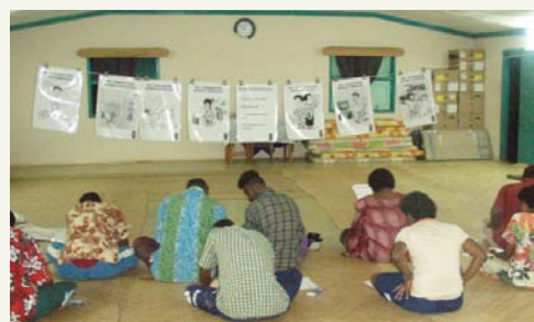
Financial literacy training with Malomalo community