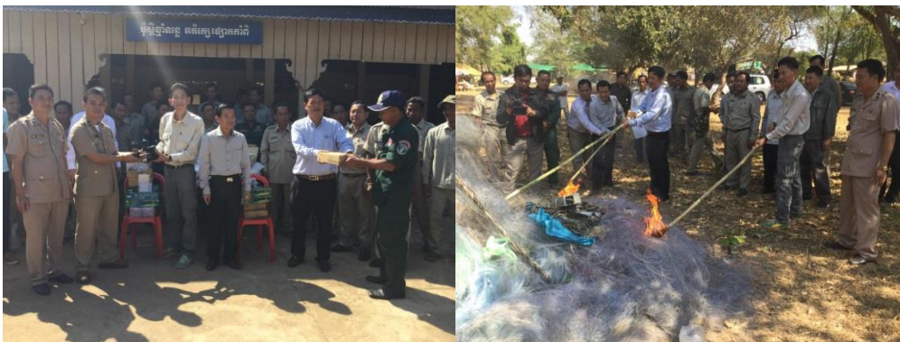
Activities of equipment handover and illegal gillnet burning at Kampi river guards outpost, Kratie

On 28 th Jan 2016, WWF and FiA organized a ceremony to handover new uniforms and patrol equipment to river guards, participated by 44 participants. There were 68 river guard uniforms, and 7 walkie talkies, 21 torches, and 21 headlights were provided to river guards. After handover ceremony, illegal gillnet confiscated by river guards in 16 outposts of Kratie province was burned.