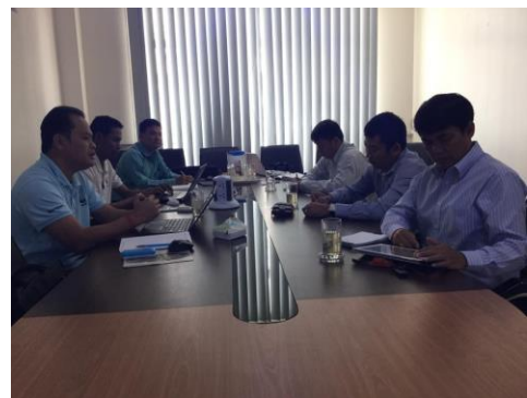
Law Enforcement Technical Meeting with FiA at WWF Phnom Penh Office

Two technical enforcement meetings conducted. As a result, an urgent law enforcement action plan to strengthen law enforcement in the first six months of 2016 developed. The meets attended by WWF-MFF staff and government counterparts and Senior Officials of Department of Fishery Conservation of FiA. The meetings were looking existing enforcement efforts and identifying challenges and issues, and then address key action points to be taken with first 6 months of 2016. See annex 1 of urgent law enforcement action plan.