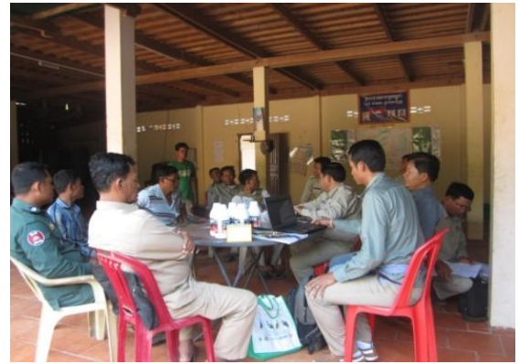
Law Enforcement Officer visiting the river guards' outposts in Kampi pool

Two joint field monitoring trips to visit river guards at each outpost in Dec-15 and Jan-16 were conducted in Kratie and Stung Treng provinces by law enforcement officer and provincial chiefs of river in both Kratie and Stung Treng aimed to strengthen capacity of river guards and joining patrol with river guards, providing additional fuel, engine oil and GPS batteries for patrolling, providing per-diem for river guards who already patrolled in the previous months and collecting patrol reports and GPS waypoints from each outpost for producing Smart Report.