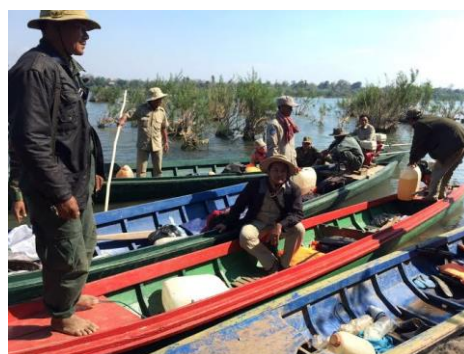
Activity of joint patrol of river guards in Kratie

Number of rigorous patrolling days at individual outpost increased from 11 patrolling days in December 2015 to 17 patrolling days in January 2016. Increasing of patrolling days of the river guards drove to decrease illegal gillnet in the river, while the number of confiscated gillnet decreased from 252 sets equalled to 13586m long in Dec-15 to only 136 sets equalled to 9818m long in Jan-16. In January 2016, there were 6 electroshock fishing poachers arrested and sent to the court.