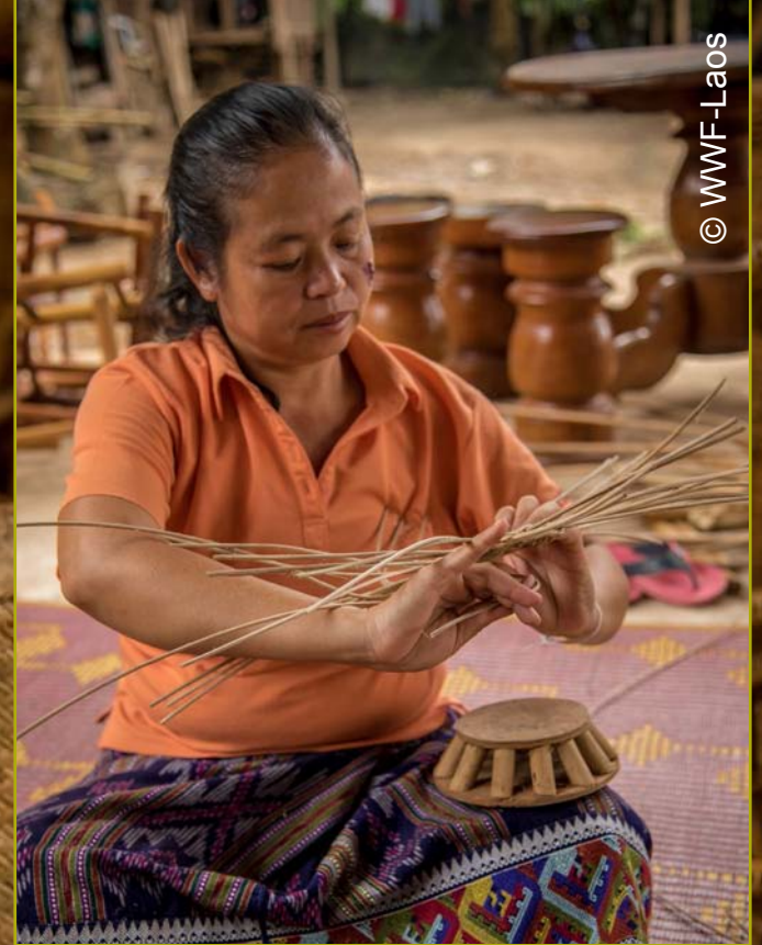
Village Woman Weaving a FSC Rattan Product

1,116 ha of rattan and bamboo forest newly inventoried in the Central Annamites Landscape.