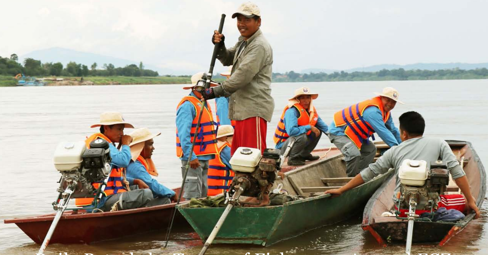
Daily Patrols by Teams of Fishermen Around FCZs

CONSERVATION HIGHLIGHTS JULY 2017-JUNE 2018, WWF-LAOS